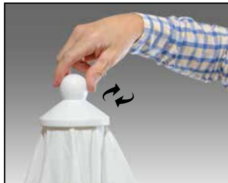
Step 3 Replace the knob onto the frame & lock the knob in place by turning it clockwise.