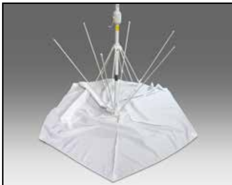
Step 4 Spread your umbrella fabric & your frame partially.