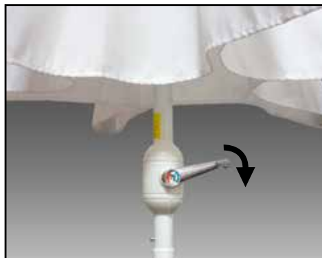
Step 1 Turn the crank until the desired open position is reached.