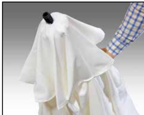
Step 2 Find a clean & open area to spread your umbrella fabric. Then, insert the top of your umbrella's main frame into the opening of your umbrella fabric.