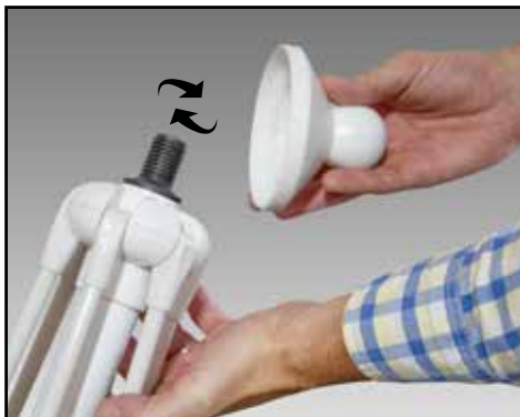
Step 1 Begin by unscrewing & removing your knob from the umbrella frame.