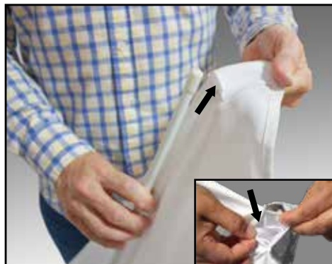
Step 5 Insert the ribs into the middle pockets located on all corners of the umbrella fabric. Repeat this step for all your ribs.