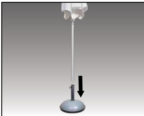
Step 7 Get your umbrella base (sold separately) & insert the pole. Make sure to secure it in place.